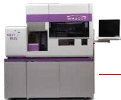
NEO IRIS® Immucor