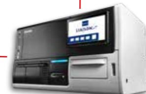
LIAISON® XS DiaSorin