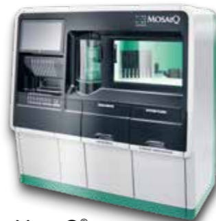
MosaiQ® Quotient Biodiagnostics

Companies that develop their own automation solutions can also benefit from decades of expertise. We have an extensive, patent-protected technology pool of modules and components that is continuously expanding.