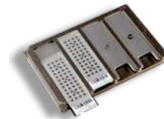
FlexiMass™-DS MALDI target Shimadzu Biotech

STRATEC Consumables provides a comprehensive range of services to help you to create a customized consumable in the most appropriate polymer. Over many years of research and development, we have developed a unique combination of skills including nano- and microstructuring, coating technologies, polymer sciences and automated assembly. We take your ideas from concept to mass production!