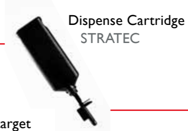
Dispense Cartridge STRATEC