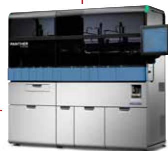
PANTHER FUSION™ Hologic

STRATEC consults, designs, develops and produces fully automated solutions for its partners in the field of diagnostics including blood banking and research. We design instruments to our partners' requirements to maximize performance of your reagents and introduce proven technology to reach outstanding reliability targets. You benefit from a proven track record of delivering market-leading diagnostic systems for random access molecular testing, heterogeneous and homogeneous immunoassays, single molecule detection and microarray-based technologies.