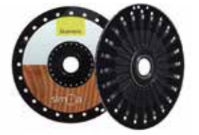
Simoa™ Disc Quanterix

STRATEC Consumables provides a comprehensive range of services to help you to create a customized consumable in the most appropriate polymer. Over many years of research and development, we have developed a unique combination of skills including nano- and microstructuring, coating technologies, polymer sciences and automated assembly. We take your ideas from concept to mass production!