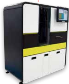
Simoa™ HD-X Analyzer Quanterix