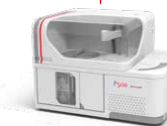
Pictus 500 Diatron

In addition to the software solutions integrated into STRATEC developed and manufactured instruments, we offer our partners flexible application options for deploying and controlling instruments, work processes and test volumes. Among other functionalities, these software solutions facilitate the interlinking of various systems, enable work volumes to be managed and provide access to the test results for evaluation by specialist staff.