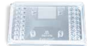
Evaluation™ Cartridge MyCartis