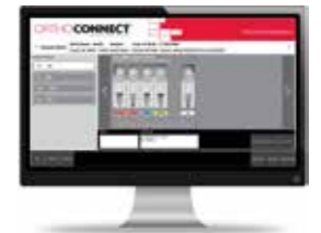
ORTHOCONNECT™ Ortho Clinical Diagnostics

Our Diatron brand offers instruments and associated reagents in the field of clinical chemistry, hematology for both human and veterinary use, immunoassay automation and molecular testing. Its portfolio includes ELISA, IFA and CLIA automated instrumentation platforms.