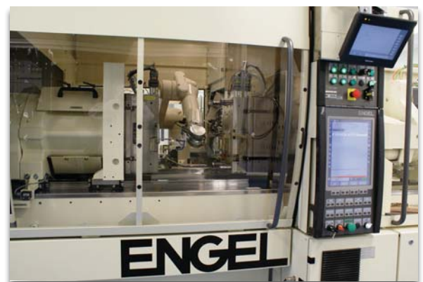
fully automated production