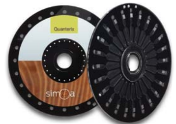
Simoa disc by STRATEC Consumables