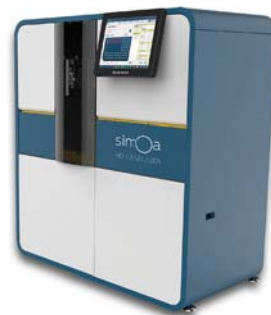
Simoa HD-I Analyzer by STRATEC Biomedical AG

close interaction between instrument and consumable manufacturer