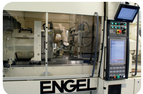
fully automated production